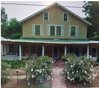
Mitchell Young Anderson Museum, Thomasville, GA