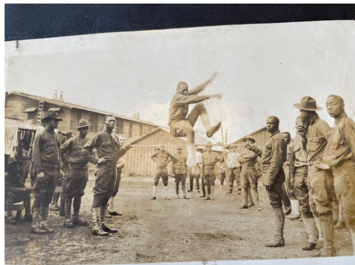
WW I. soldiers at ease at Presidio (?)